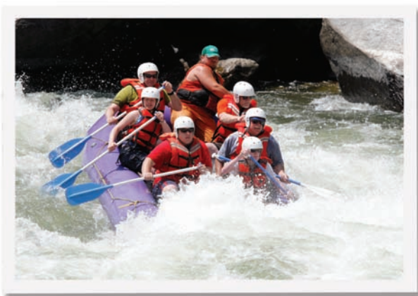
Crew 2045 white water rafting