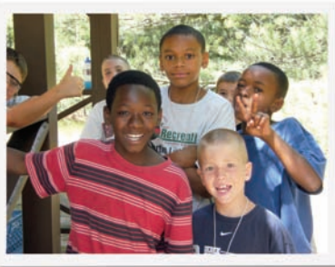
Scoutreach youth enjoy summer camp